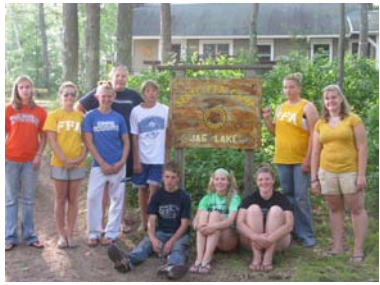
Students who attended Jag Lake