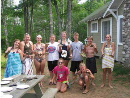
All the fish we caught at Jag Lake

To see more pictures go to the Craig website www.janesvillecraigffa.org and click on photos and Jag Lake photo album.